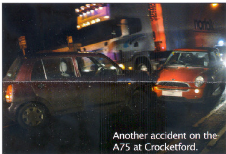
Another accident on the A75 at Crocketford.