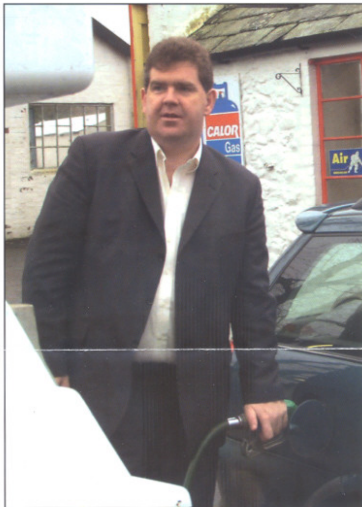
Prices at local filling stations are set to rise further as Gordon Brown raises fuel taxes again.

Yet with family budgets stretched and uncertainty over jobs at an all time high, this raid on rural motorists is angering local people from Stranraer to Dumfries. It's time for a change of government to set a new course for the country.